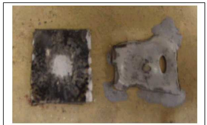
Figure 3. Refractory paint coated square (left) and uncoated square (right) of high density polyethylene after exposure to direct flame of a propane torch for 20 seconds, at a distance of 1 inch.