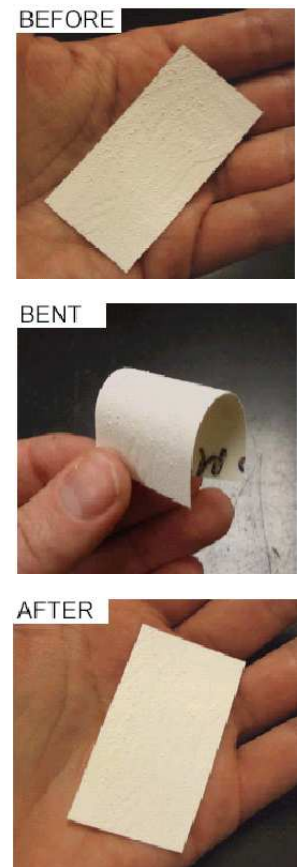
Figure 1. Photographs of ceramic coated polyethylene terephthalate (Mylar ® ) flexible substrate showing no cracking or delamination during 180° bending.

Tests for surface flashover and electrical discharge resistance show that plastic insulators coated with Eltron's refractory paint possess superior insulating and breakdown properties, compared to solid ceramic insulators, while retaining the weight advantages and mechanical resilience of plastic insulators.